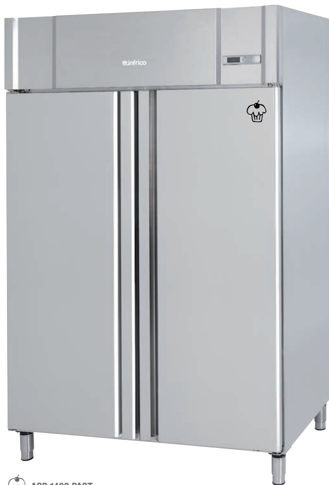
AGB 1402 PAST

Refrigerator and freezer for confectionery 600x400 · Armoire réfrigération et congélation gastronomique pâtisseries 600x400