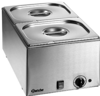
200.232 2 x 1/2 GN