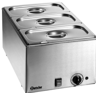
200.233 3 x 1/3 GN