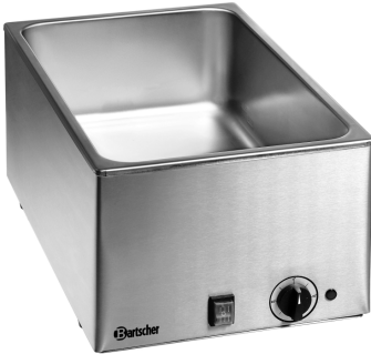
200.230 1 x 1/1 GN